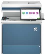
HP Color LaserJet Enterprise Flow MFP 5800zf Printer

This printer is intended to work only with cartridges that have a new or reused HP chip, and it uses dynamic security measures to block cartridges using a non-HP chip. Periodic firmware updates will maintain the effectiveness of these measures and block cartridges that previously worked. A reused HP chip enables the use of reused, remanufactured, and refilled cartridges. More at: http://www.hp.com/learn/ds